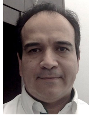
management and machine learning.

Scientists for scientific merit (SNI Fellow, Level 2). He is a member of the Network for Decision Support and Intelligent Optimization of Complex and Large Scale Systems, Mexican Society for Operations Research and System Dynamics Society. He has research articles in science citation index journals, books, conference proceedings, presentations and book chapters.