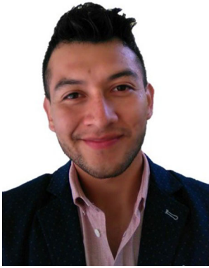
analytics, innovative procurement and providers development.