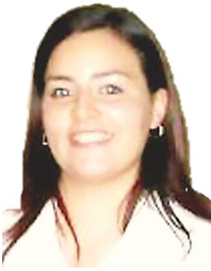
tics and Supply Chain and the Mexican Society of Operations Research.